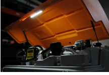
10378 - LED instrument lighting with motion sensor and battery