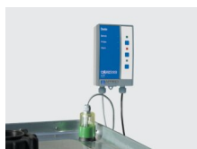
7391 - Leakage warning device 230V, optical and acoustic