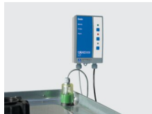
7391 - Leakage warning device 230V, optical and acoustic